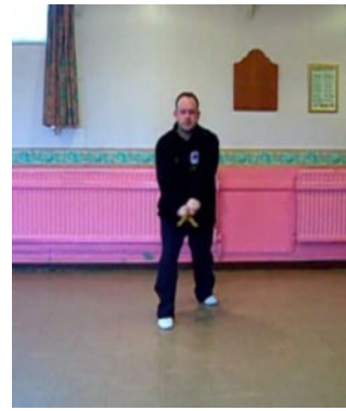
and perform a low section X block.