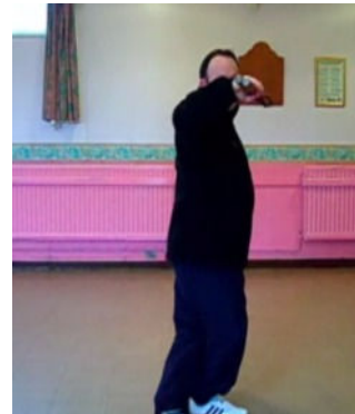
landing in right leg supported stance and perform a right handed double handle strike to the front in high section. ( KIHAP )