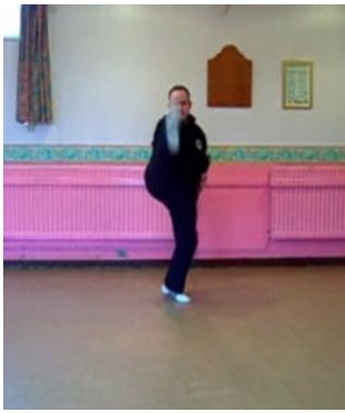
Pull the flails to the left and execute a right leg mid section front kick, landing in right leg short stance