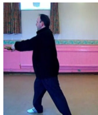
Step forward right foot into right leg long stance and execute a right supported obverse thrust strike.