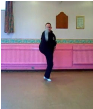
Pull the flails to the left and execute a right leg mid section front kick,