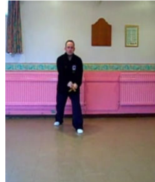
and perform a low section X block.