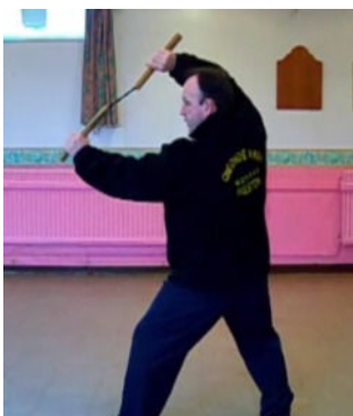
Look left and rotate 180° into left leg back stance and perform a high section diagonal block to the left.