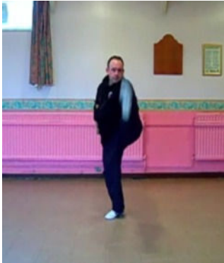
Pull the flails to the right and execute a left leg mid section front kick, landing in left leg short stance